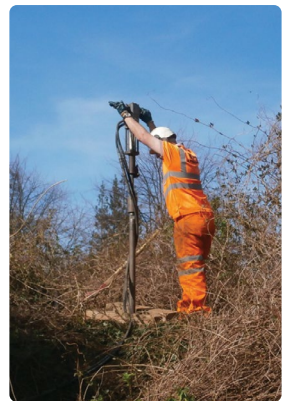
In difficult-to-access locations, hand-held equipment can be used.