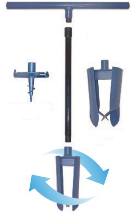
Hand auger borehole.

This method requires only one person and can usually be completed in a matter of hours.