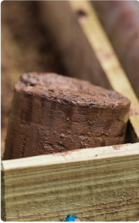
Core samples undergo physical and chemical laboratory testing.

Laboratory testing is divided into two broad categories: physical and chemical.