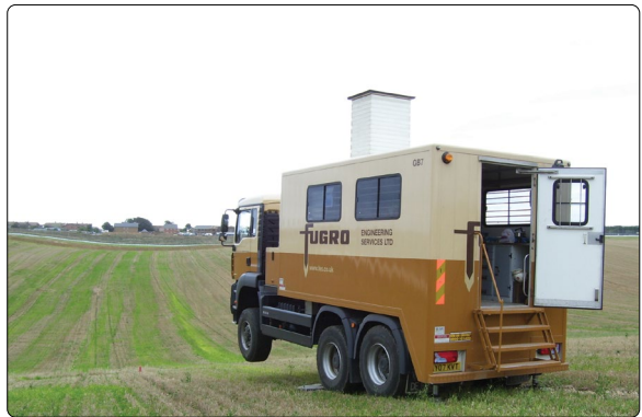
Cone penetration testing.

The cone is generally used to investigate soft soils. Sensors on the cone can measure a variety of properties of the ground, including resistance, friction and water pressure. The results enable a profile of the layers the cone passes through to be produced and properties to be assigned to the different materials. This technique is normally used in rural locations where the ground is soft, such as river flood plains. It requires two people, but tests are generally short (30-60 minutes) so they can carry out multiple investigations each day.