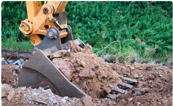
Pit or trench dug to investigate soil conditions from the surface and to obtain samples.

Pits and trenches enable the profile of the ground to be observed from the surface and samples to be obtained for testing. If it is critical to closely examine the ground, the sides of the excavation are shored with timber or a purpose-made support system before any work is carried out. Excavations reinforced in this way are called either observation pits or trenches.