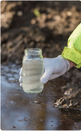
Surface water sampling.