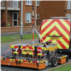
Large-scale ground-penetrating radar can be attached to a van. Image courtesy of Macleod Simmonds.

Surveys can locate underground metal tanks, utility pipes and potentially contaminated groundwater. They are used to identify areas that need further geophysical or 'in-ground' investigation.