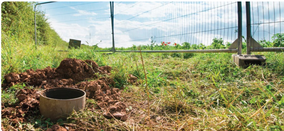
On completion, boreholes are filled or further instrumentation installed.

On completion, the borehole is either back-filled with the excavated soil or instrumentation is installed – for example, to monitor water levels. Where an installation remains in place, the only thing visible is a small cover, level with the ground, or a small steel barrel to provide protection.