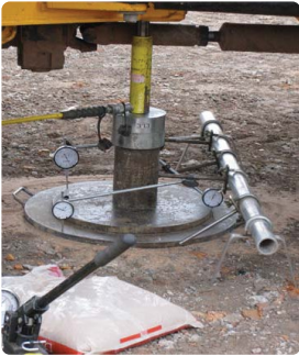
Plate load tests.