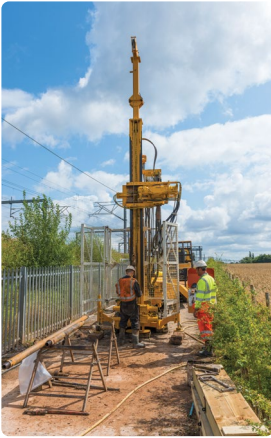
Drilling of a small borehole via a rotary core rig.