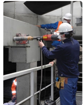
Concrete core (structural investigation).