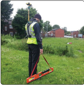
Electromagnetic conductivity.