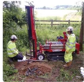
A motor-driven hammer pushes a cone into the ground for dynamic probing.

A steel tube is rotated into the ground to a depth of up to 5 metres. The tube is then extracted and a section removed, or a flap is opened, to view a sample of the sub-surface soil profile and structure. Samples can be taken for laboratory testing. This technique can be used in multiple locations in one day and in both urban and rural locations. The equipment requires one or two people to operate.