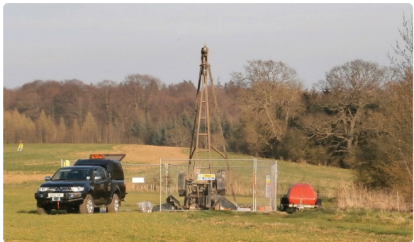
Cable percussion borehole.

A variety of tools are raised and lowered, either by a cable and winch or a series of steel rods, to drill the borehole, take samples or carry out tests in the borehole.